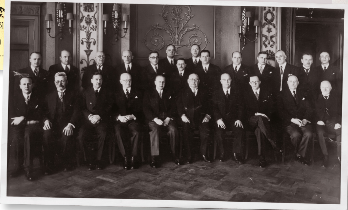
Senators and judges of the Chamber of Courts gathered for lunch at the Riga Latvian Society House on 10 April 1938

A portrait of Senator Augusts Lēbers is placed at the entrance of the Riga Crematorium. This is because Lēbers founded the Latvian Cremation Society in 1925 and ensured that the Parliament passed the Cremation Law. The Riga City Council allocated the necessary land for the crematorium in the Brethren Cemetery and in 1939 the Cabinet of Ministers approved the project for a new crematorium. However, the building was not completed until after Latvia regained its independence, and the first cremation took place in 1994.